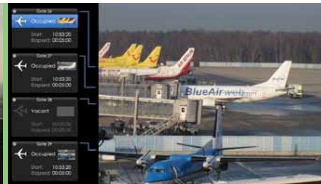
Gate time usage monitoring