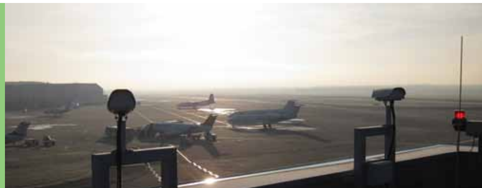
Remote apron management