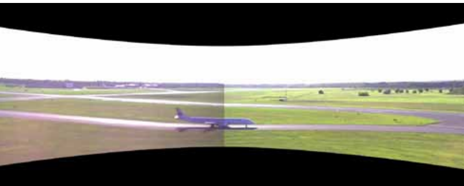
Out-the-window view with panoramic video stitching