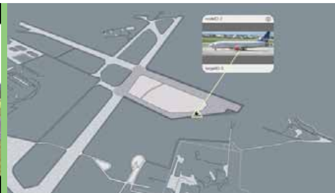
Target tracking with contextual video (2D display)